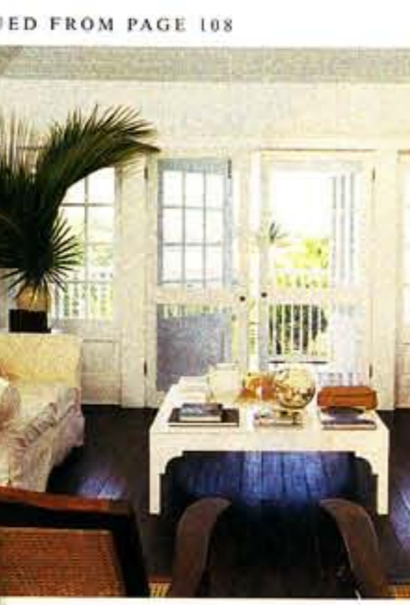
Far left, a 1960s postcard; left, a Harbour Island guesthouse.