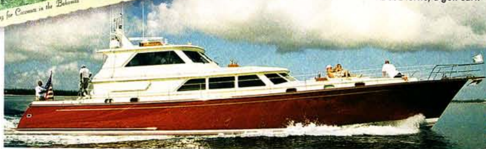
Clockwise from left: a yacht; a sea turtle; a golf cart.