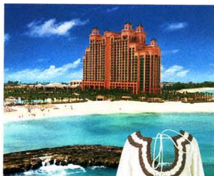
Clockwise from above: the Cove Atlantis; Anya Hindmarch cover-up from the Escape by Vivre boutique; blackjack cards.

ACCOMMODATIONS: Oceanfront home sites, island cottages, and colorful beach bungalows. Club members can buy or rent them. DINING: Two private clubhouses offer fine-dining restaurants. There will be more restaurants and bars in the Marina Village, due to open in spring 2010. SPAS: Two. PRIVACY: Exclusive. WATER SPORTS: Outrigger-canoe paddling, sailing, surfing, kiteboarding, fly-fishing, lobster diving, bonefishing, and deep-sea sport fishing. ON-LAND FUN: Play the 18-hole championship, Tom Fazio-designed golf course. Mountain biking. FUN FACTS: You can snorkel or scuba off the shores of Baker's Bay, home to the third-largest reef in the world. There are turtle habitats along the beachfront. And this is a golf-cart-only property.