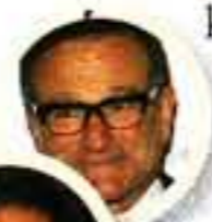
From left: Bluepoint, one of the guesthouses on Copperfield Island with its own private beach; Oprah Winfrey; Robin Williams.

scuba diving, WaveRunners, a catamaran, and four other boats at guests' disposal. ON-LAND FUN: Tennis, volleyball, and badminton courts; karaoke machines; fireworks and treasure hunts. PRIVACY FACTOR: Total. FUN FACTS: There is an outdoor movie theater, and you can play on Houdini's personal championship billiards table. GUESTS HAVE INCLUDED: Oprah Winfrey, Robin Williams, and Tim McGraw.